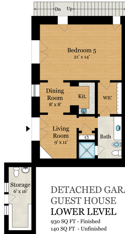
DETACHED GARAGE/ GUEST HOUSE LOWER LEVEL 930 SQ FT - Finished 140 SQ FT - Unfinished