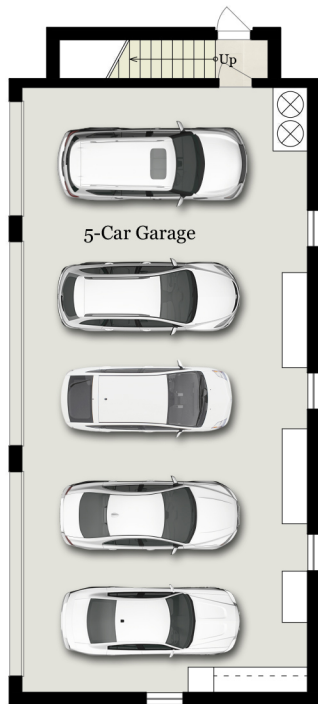
DETACHED GARAGE/ GUEST HOUSE MAIN LEVEL

1,170 SQ FT (Unfinished) and 80 SQ FT (Finished)