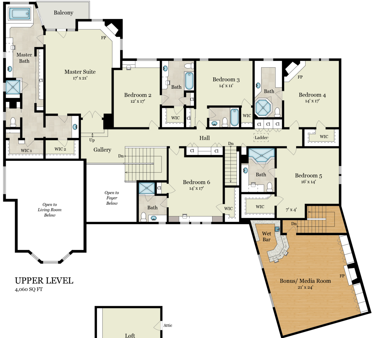
UPPER LEVEL 4,060 SQ FT