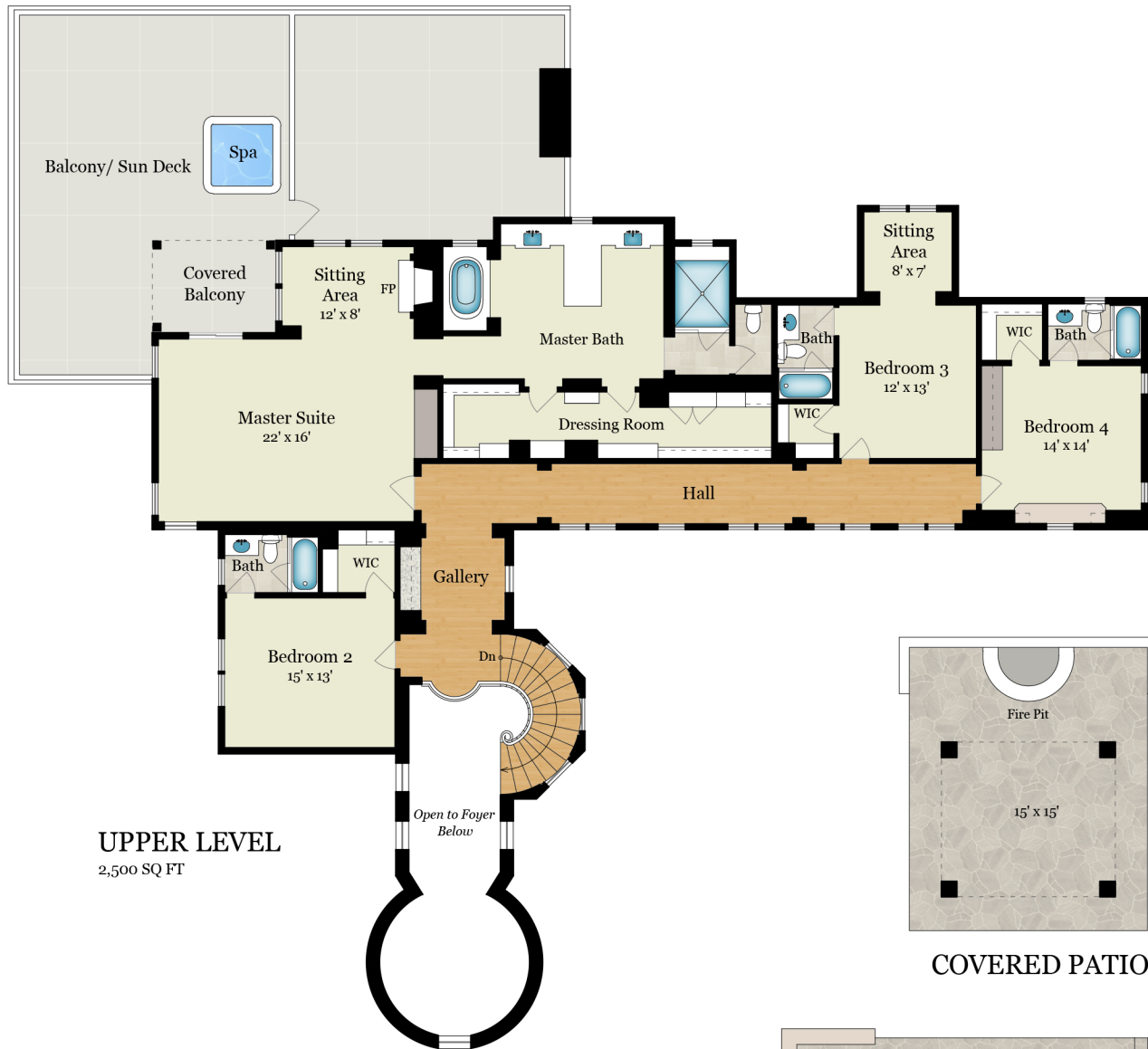
UPPER LEVEL 2,500 SQ FT